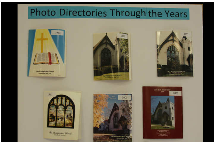
As part of introducing our new Photo Directory, we display some nostalgic Photo Directories from the past. They were a big hit!