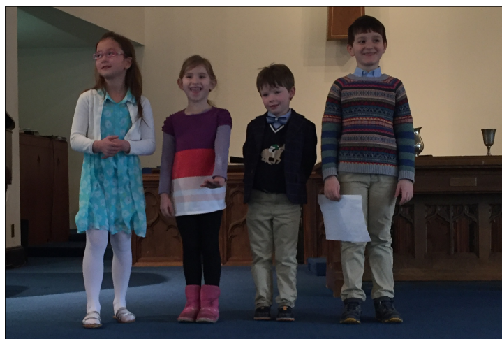
On March 20th we heard from some of our youngest singers!