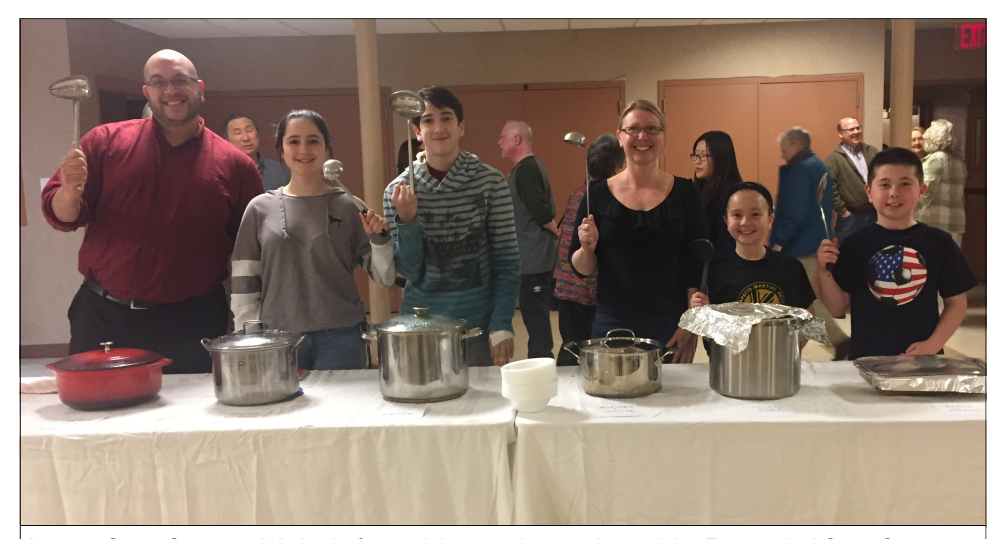
Lenten Soup Supper - We had 70+ participants when we hosted the Ecumenical Soup Supper on March 8th. Our great "soup servers" pictured above.