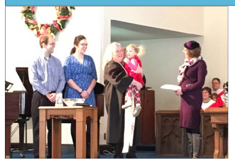
January 8th - we celebrate our first 2017 baptism!