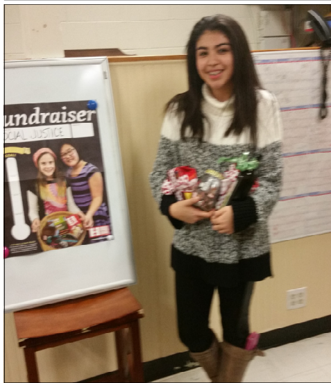
Social Justice Interns selling Equal Exchange coffee, chocolate and olive oil as a fundraiser to support their mission