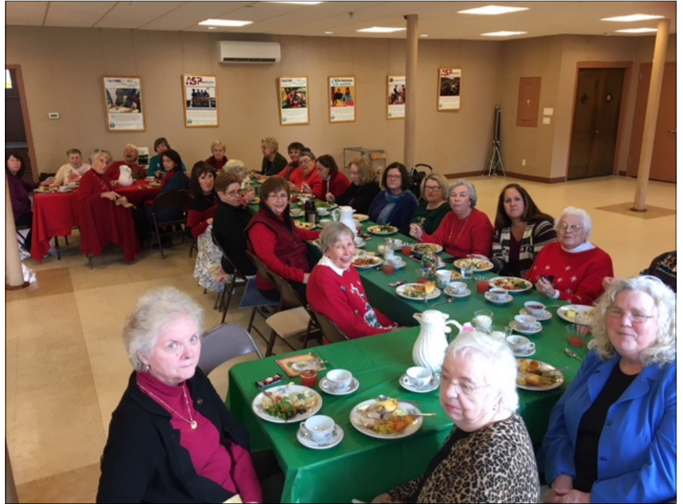
Hearts & Hands gathered for their Christmas celebration lunch. This is our ever- growing group that sews, knits and does other hand work for mission projects and fun.

For all those who are interested in learning more about ASP and those who have contributed.