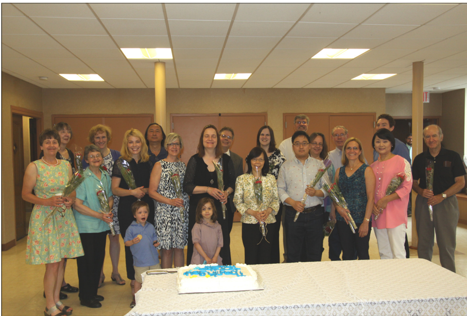
Choir Recognition Sunday - June 5th - After giving the congregation the gift of beautiful music, the Choir was thanked with cake and flowers for their music, weekly commitment and enhancing our worship experience.