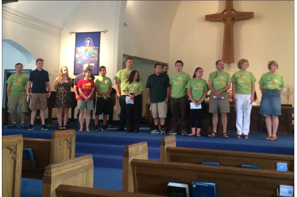
ASP Commissioning - June 26th - As the Appalachia Service Project team prepares for their trip, the congregation commissioned them for their work and safe travels.