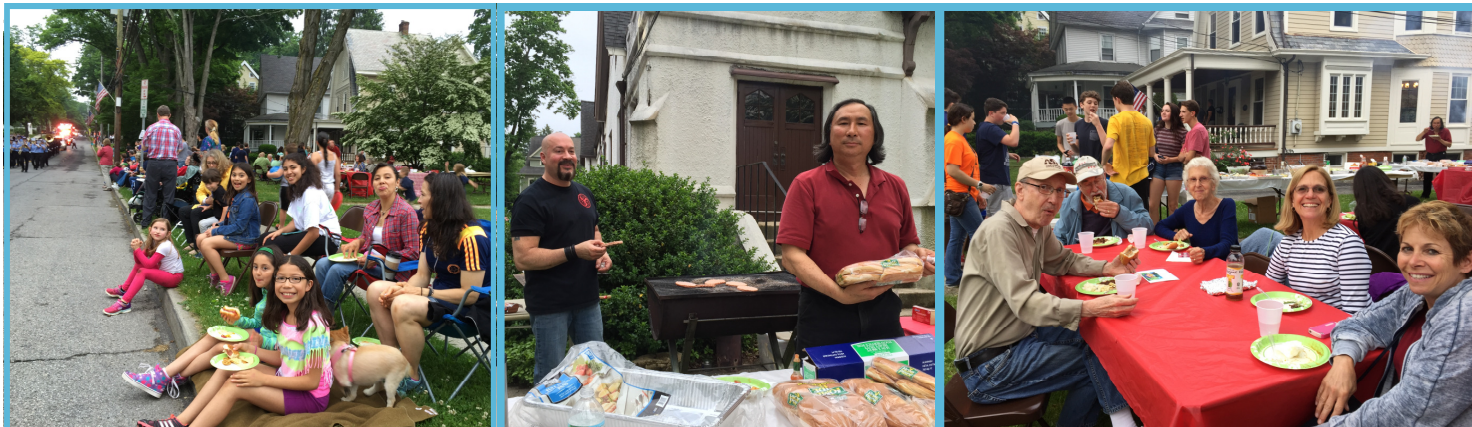
Fireman's Parade and Church BBQ - June 3rd - Many people celebrated by watching the parade and eating delicious food - thanks to all who made it happen and to those who attended!