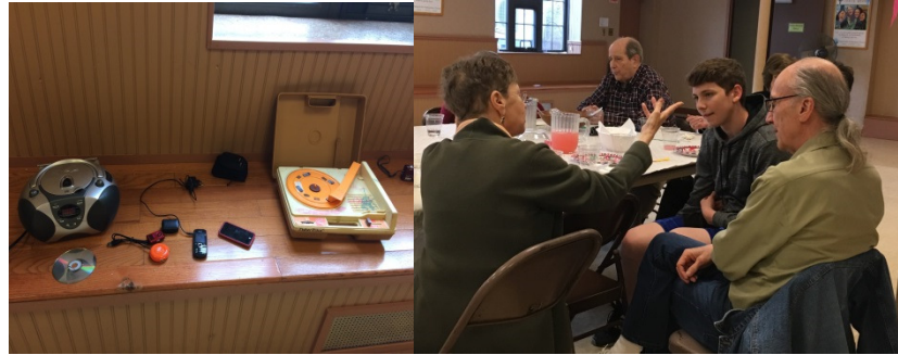
What IS that?! Enjoying Intergenerational Storytelling Night

ASP Commissioning Sunday All are welcome - 10 am