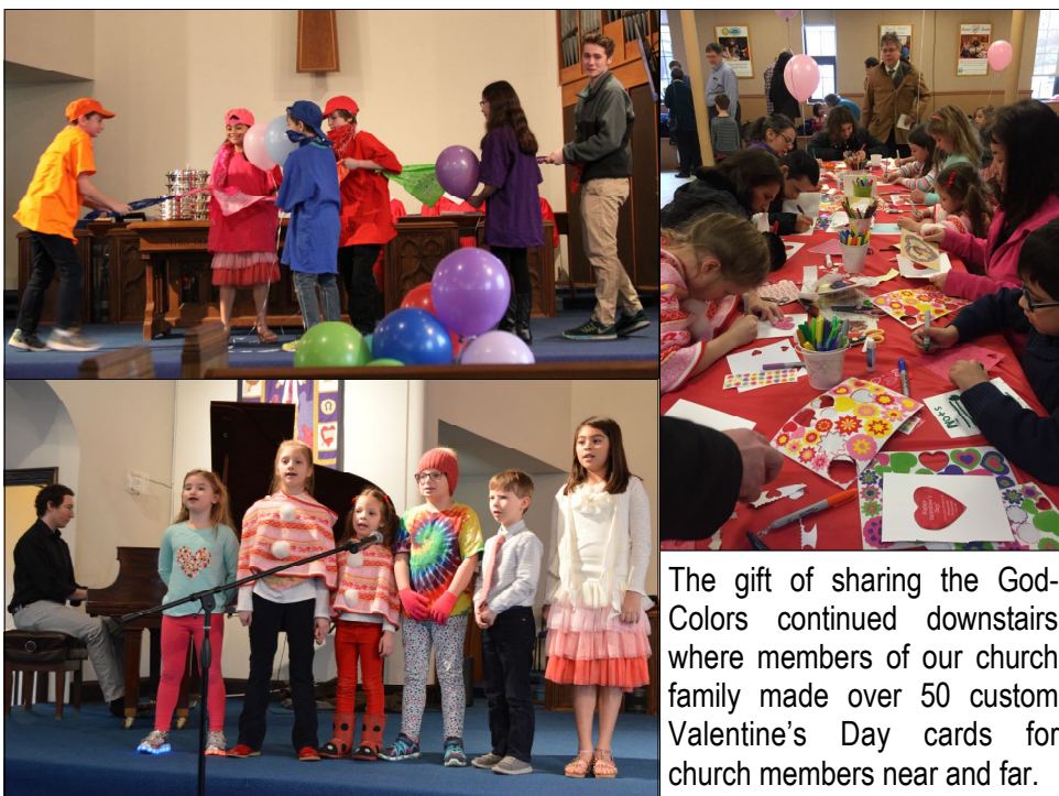
The gift of sharing the God-Colors continued downstairs where members of our church family made over 50 custom Valentine's Day cards for church members near and far.

Special thanks to the Sunday School teachers, music directors, and behind the scenes adults who made the beauty happen.