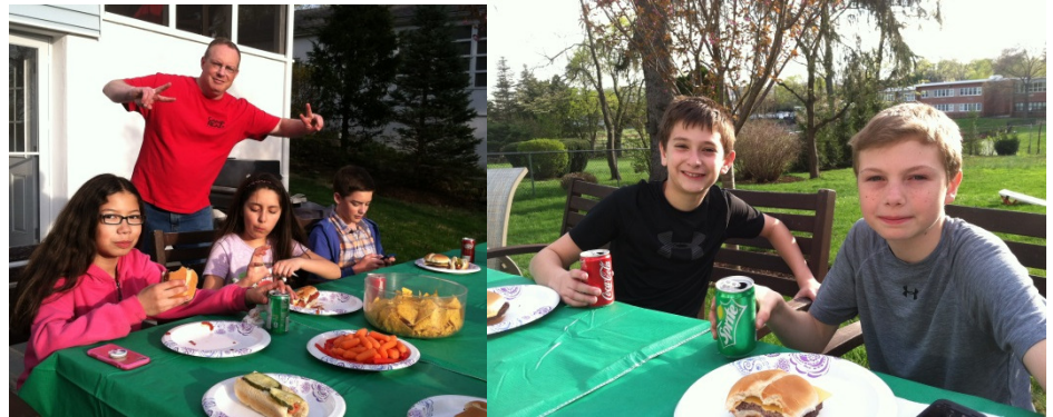
Youth Group Progressive Dinner – we're all about the food